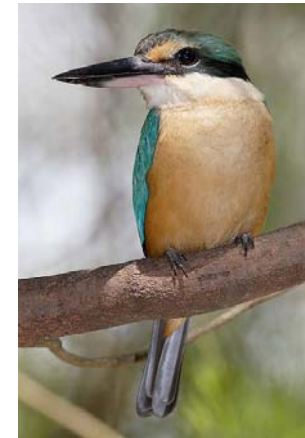
Sacred Kingfisher ( Todiramphus sanctus )