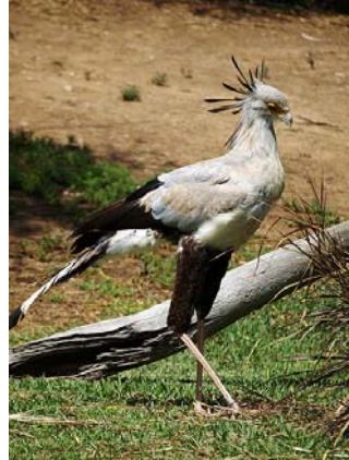
Bald eagle ( Haliaeetus leucocephalus ) Secretary Bird ( Sagittarius serpentarius )