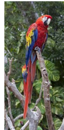
The Scarlet Macaw ( Ara macao )