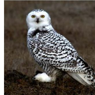
The Snowy Owl ( Bubo scandiacus )