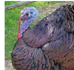
Turkey in Portugal