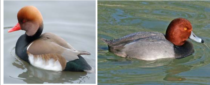
Red-crested Pochard -male