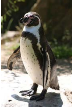
Humboldt Penguin ( Spheniscus humboldti )