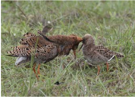
The Ruff ( Philomachus pugnax )