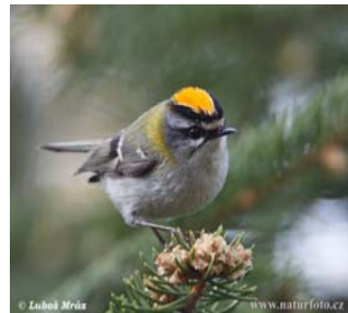
The Goldcrest , Regulus regulus