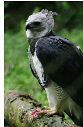
The Harpy Eagle ( Harpia harpyja )