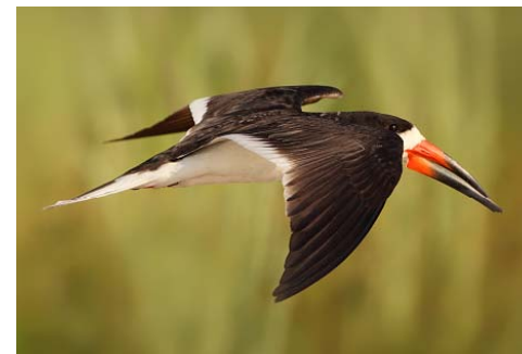
The Black Skimmer ( Rynchops niger )