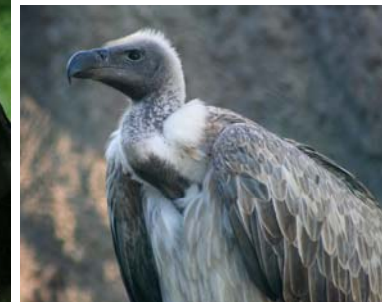
Vulture ( Gyps africanus )