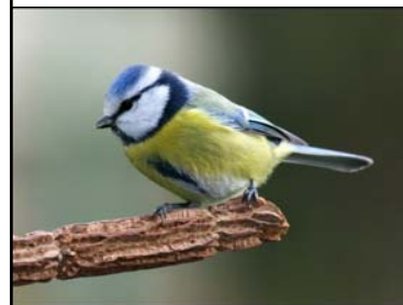
Paridae (tits, titmice)