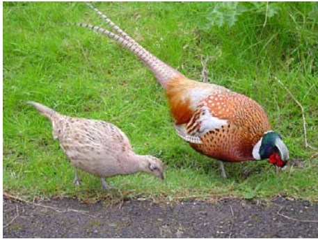
Common Pheasant ( Phasianus colchicus )