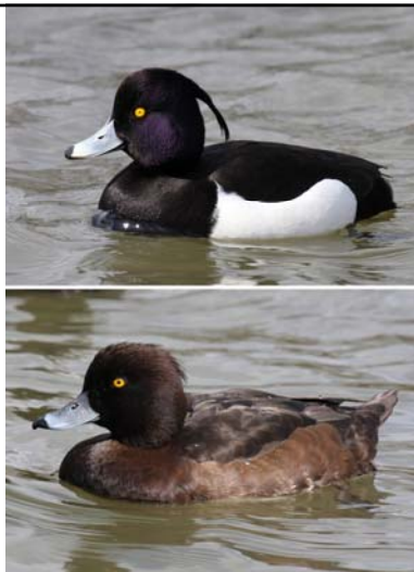
tufted duck ( Aythya fuligula )