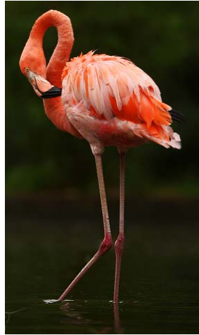
Greater Flamingo ( Phoenicopterus roseus )