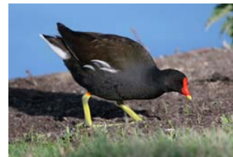
Common Moorhen, or Common Gallinule, ( Gallinula chloropus )