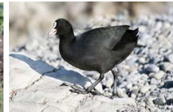
Eurasian Coot, (Fulica atra)