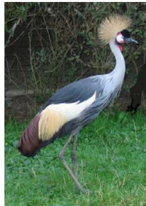
Grey Crowned Crane ( Balearica regulorum )