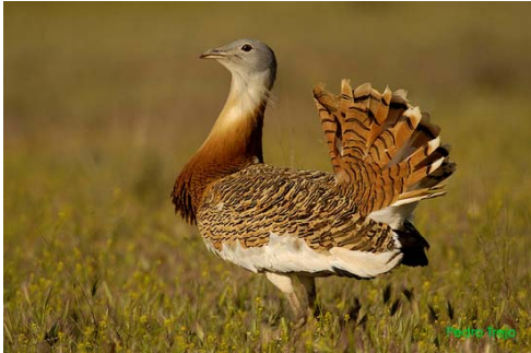
Great Bustard, Otis tarda